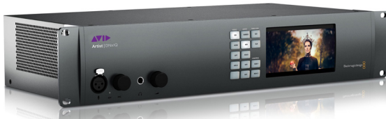
Capture, monitor, and accelerate SD, HD, UHD, 2K, and 4K editing with an Avid Artist | DNxIQ interface.

For the latest Media Composer requirements, qualified systems, and configuration guidelines, please visit www.avid.com/MCreqs .